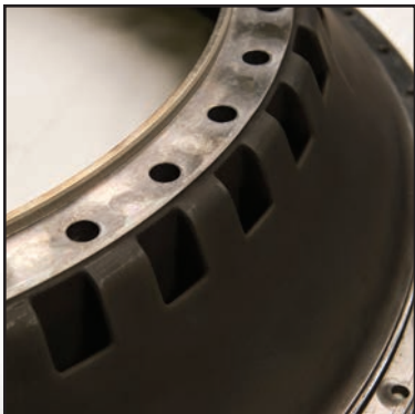
Tangential On Board Injection (TOBI) duct out of engine