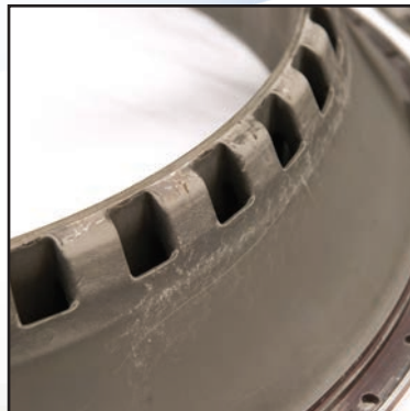
TOBI duct flange removed